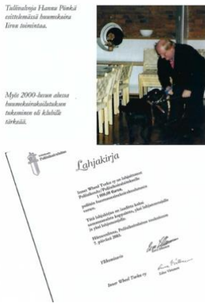
Rotary D1410 and Inner Wheel gave donations to the Customs Services. This is "Iiro", one of these drug dogs, worth 1000 €